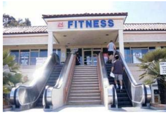
Only in America