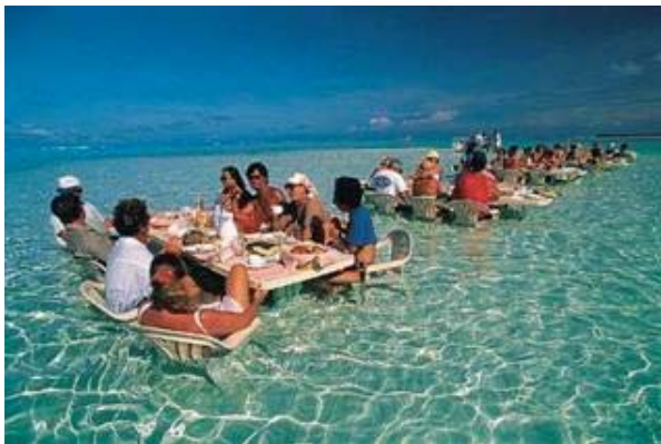
Only in Hawaii